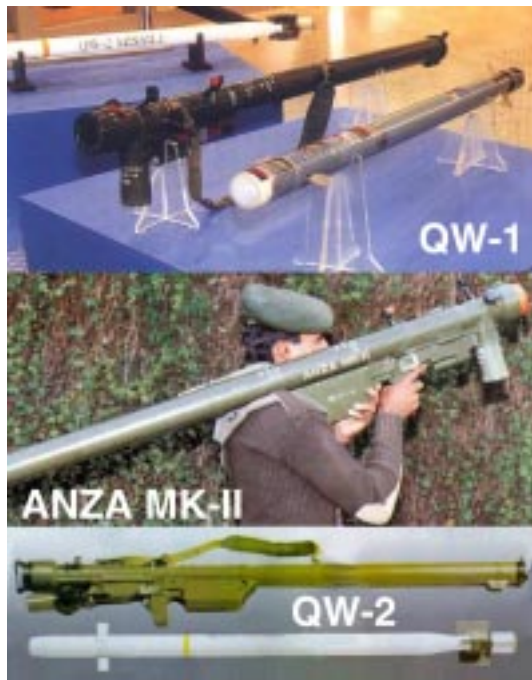
China has become a major player in the MANPADS export market. The HN-5B MANPADS was supplanted in production by the QW-1 with a cooled Indium Antimonide all aspect midwave infrared seeker. The more recent QW-2 incorporates incremental improvements and is being marketed as an equivalent to the Iгла, FIM-92B Stinger and Mistral series. The QW-1 series are easily recognised by the cylindrical BU/BCU module mounted at a right angle to the missile tube. Pakistan is a major export client for the PRC and has licence built the HN-5B as the ANZA MK-I and the QW-1 as the ANZA MK-II.

In best case scenarios the operator may fire the missile at the limits of viable geometry and it will fall out of the sky before it hits. If it hits with low kinetic energy it may not do much damage. If the missile is time expired the warhead may lose effectiveness or the fuse may fail. However, reliance on