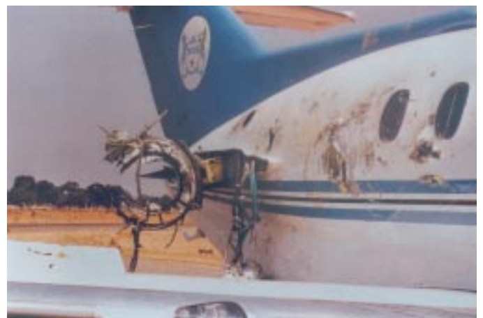
This BAe 125 corporate jet lost its starboard engine to an SA-7 whilst over Southern Africa. Incidentally, the crew thought the engine had simply failed and flamed out as their engine instruments went dead. It wasn't until they landed that they realised what had happened. The object of the attack was to destroy the aircraft and its African Head of State passenger. Note the extensive pattern of missile and engine fragment damage on the fuselage and flaps. Primary and secondary damage effects to structure, fuel, flight control and hydraulic systems can be more lethal than the loss of an engine as evidenced by numerous catastrophic engine loss case studies.

Whether an aircraft is to drop flares or use a jammer, knowledge of an attack in progress is vital. Missile Approach Warning Systems remain an area of controversy. Three technologies are used – active Doppler radar, passive infrared and passive ultraviolet. For military applications the Doppler radar approach is often rejected as it is