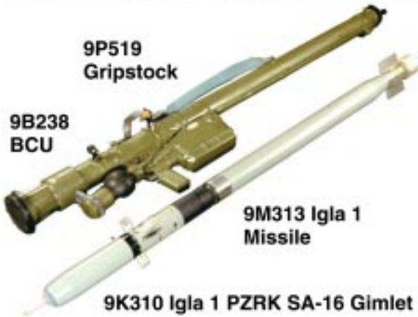
Russia remains a significant manufacturer of MANPADS. The 9M32 series was supplanted by the improved 9M34 Strela 3 or SA-14 Gremlin, in turn replaced by the largely redesigned 9K38 Igla or SA-18 Grouse and 9K310 Igla 1 or SA-16 Gimlet. The Igla series of missiles is credited with a cooled two colour seeker making it a technological equivalent to the FIM-92B/C series and highly resistant to flares. The distinctively shaped BCU makes these weapons easy to identify. (Author/Rosoboronexport).

not unlike the Concorde crash, or other situations where catastrophic fires or structural damage occurred. However, other combinations of circumstances could see the aircraft damaged but capable of limping on and making an emergency landing.